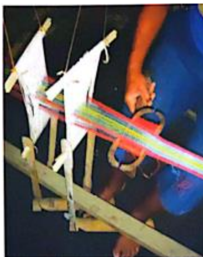
Figure 1. Loom used by Tabanan weavers to produce 10 cm wide bands

Balinese woven borders have long served as a profound expression of cultural identity and social hierarchy, playing a central role in the island's rich textile tradition. Originating from ancient customs, these borders were more than just decorative features; they symbolized status, spiritual beliefs, and community identity. Their intricate designs often reflect local folklore and sacred narratives, seamlessly intertwining storytelling with artistic craftsmanship (Langi & Park, 2016). This practice aligns with the broader concept of Creative Multilingualism, which emphasizes how linguistic and cultural diversity enrich artistic expressions. In Bali, the interplay between local dialects and symbolism deeply informs the motifs and techniques chosen by weavers, further embedding textiles within the island's cultural fabric (Astara et al., 2019).