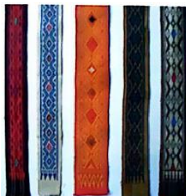
Figure 3. Five to Six cm wide bands from leftover thread, woven by Buleleng weavers

Symbolism and Aesthetics in Balinese Woven Borders: Interpreting Patterns and Colors Through Beliefs and Rituals. Rooted in a rich cultural heritage, the woven borders of Balinese textiles carry profound symbolism and aesthetic value. Each design element found within these borders serves not merely as decoration but as a narrative device that communicates stories, beliefs, and social status ("Unraveling the Sacred Connection: the Sidakarya Mask and Pemuteran Jagad Sidakarya Temple in Balinese Culture," 2023). Intricate patterns often represent natural elements, such as flora and fauna, intertwining with motifs that reflect the spiritual and cosmological worldview of the Balinese people (Susiani, 2021). This visual language transforms textiles into sacred objects, often used in rituals, thereby enriching the spiritual lives of the community. Moreover, the intersection of traditional craftsmanship with modern interpretations of these woven borders illustrates a dynamic cultural evolution. As noted in contemporary artistic expressions, Balinese textiles increasingly engage with global artistic dialogues, revealing these cultural symbols' adaptability and enduring significance.