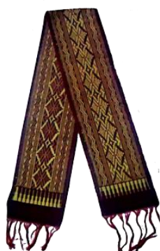
Figure 4. A sash 12cm wide, woven in Buleleng

In the intricate tapestry of Balinese culture, woven borders serve not merely as decorative elements but as vital expressions of spirituality and identity. The patterns and colors inscribed within these textiles resonate deeply with local beliefs, embodying meanings that reflect the Balinese worldview (Komalsari et al., 2024). Each motif and hue is important, often corresponding to specific religious or community rituals (Riastini et al., 2020). For instance, woven Lurik is recognized for its sacred values and is believed to bring good fortune and guidance to its possessors (Pryanka, 2023). Therefore, the interpretation of Balinese woven borders transcends aesthetic appreciation; it invites observers to engage with the profound belief systems that govern the people's lives, reinforcing the importance of these textiles as conduits of cultural heritage and spiritual significance.